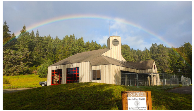
North Fire Station, ready for delivery of Christmas Trees.

be moved an acceptable distance from the swale. With the swale now recorded on the topographical survey our next task is to determine a new footprint location with our architect, Don Jacobs, and then perform the final study, the Geological Survey, in the most appropriate location. The geological study will confirm the foundation conditions required and allow Don to get started on preliminary structural and architectural drawings. That will be when our main driver, funding, will require our serious attention.