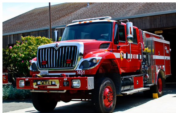
Our new Type 3 engine will look very much like this.